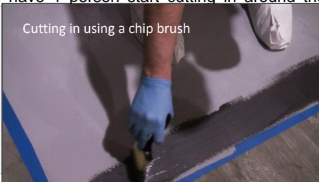
Cutting in using a chip brush

Since Pure Metallic epoxy has a 30 minute pot life, and it may take you longer than that to "cut-in" around the edges of the floor, we recommend having at least 3 people to assist with all aspects of the Pure Metallic application. 1 person to mix material, 1 person to roll out the basecoat and cut in, and 1 person to apply the effects. Mix part A and B together thoroughly. (Mix Ratio 2 parts A, to 1 part B) Remember: Once mixed, you must get the material out of the can in 30 minutes or less, otherwise it will harden. We recommend pouring out a small portion of the basecoat kit around the edges of the 200 square foot section you will be covering, and then pour the rest of the material on to the floor in ribbons making sure not to pour it outside of the 200 sq/ft section you will be coating. Once the material is out of the can completely you can have 1 person start cutting in around the edges.