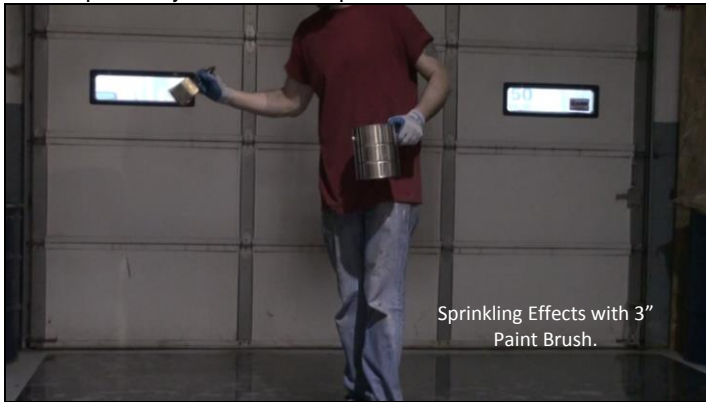
Sprinkling Effects with 3" Paint Brush.

We recommend keeping the drops of effects as close together as possible. Overlapping of effects gives the floor a much more appealing and dramatic look. Over the next few hours the effects will morph over your area and spread.