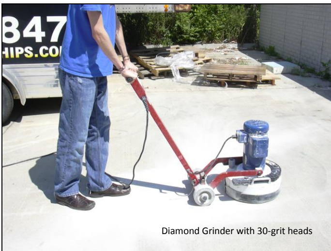
Diamond Grinder with 30-grit heads

MIXING: The entire contents of each container (Part A & part B) must be mixed together. Add the converter portion to the base portion slowly with continued agitation. Once the two components are mixed you have 50-70 minutes to use it. Norklad WB Primer has a low viscosity so usually one gallon will cover about 250 sq/ft when properly rolled out.