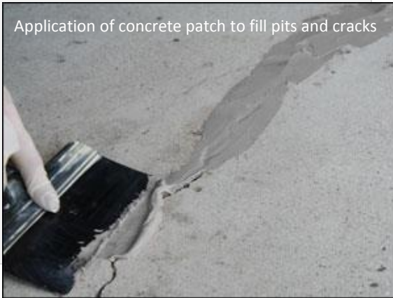
Application of concrete patch to fill pits and cracks

Fill pits and puck marks by using any patching compound (such as Norcrete Crack Filler), making sure to carefully follow the instructions as directed by the manufacturer of the product. Wait 24 hours for compound to fully cure before etching or grinding your concrete. WARNING: if you do not patch your concrete surface prior to applying the Pure Metallic System you run the risk of seeing the imperfections through the coating. With Pure Metallic Epoxy, the imperfections show up much more prevalent than with standard epoxy floor coatings.