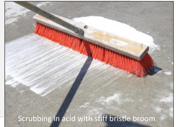
Scrubbing in acid with stiff bristle broom

Begin by diluting the etching solution with water (mix 1 gallon of solution with 1 gallon of water). Pour onto surface and scrub into the pores of the concrete with a stiff bristle broom.