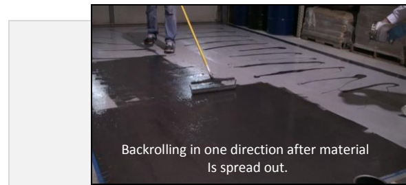
Backrolling in one direction after material is spread out.

For best results you want to apply the effects immediately after the section is rolled out.