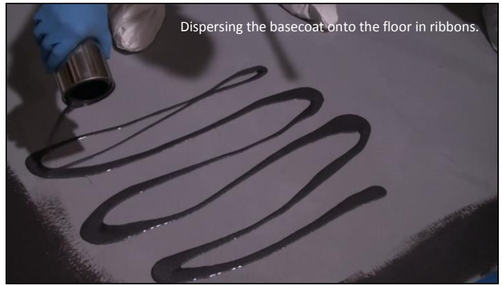
Dispersing the basecoat onto the floor in ribbons.

If you are using a roller to apply the Pure Metallic basecoat, you will need to roll fairly aggressively to move the material around. After the basecoat has been evenly dispersed, gently backroll the entire wet area with your roller (3/8" nap) in one direction to further promote even coverage.