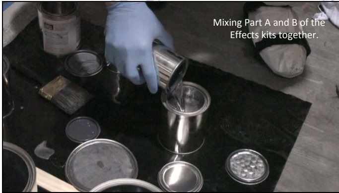
Mixing Part A and B of the Effects kits together.